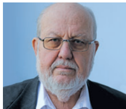
K. Vocelka (© Karl Vocelka)

Requirements: Attendance and participation in class discussion constitute 30%, a short paper 30% and a written final (essay-type) 40% of the grade.