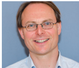
E. Gnan (@SHS)

This course is regularly organized with the support of the Oesterreichische Nationalbank (Austrian Central Bank).