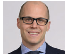
C. Koller (© Paris Zizos)