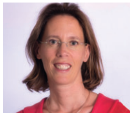
C. Kwapil (© Oesterreichische Nationalbank)